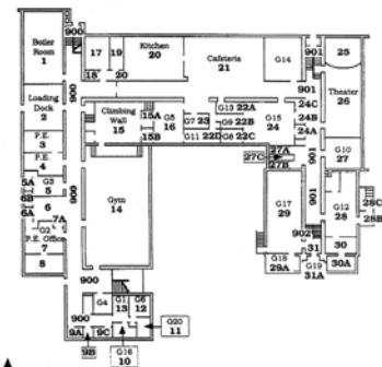
Eliot Ground Floor

For more information, please contact: Garfield Clark 612-333-6688 gclark@garfieldclark.com